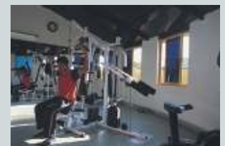
The fully equipped gym at Homestead

homestead serviced apartments off lavelle road