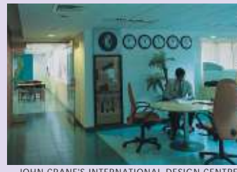
JOHN CRANE'S INTERNATIONAL DESIGN CENTRE