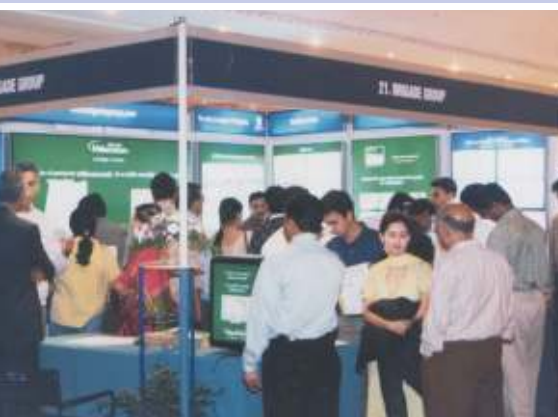
Brigade Group's stall in Reality 2002, the annual property exhibition of the Karnataka Ownership Apartments Promoters Association (KOAPA), held at Hotel Ashok, Bangalore, between 18 and 20 Jan '02.

We hope you enjoy this issue of insight. As always, we look forward to your feedback.