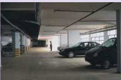
A VIEW OF THE BASEMENT PARKING, LEVEL 1