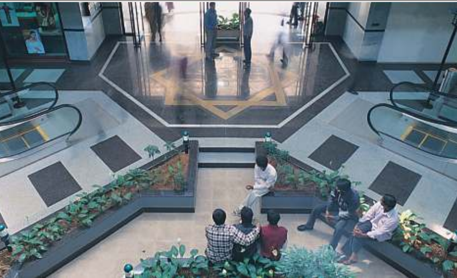
The central courtyard at Brigade Plaza