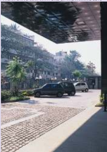
FRONT DRIVE-WAY WITH ONE OF THE PARKING LOTS