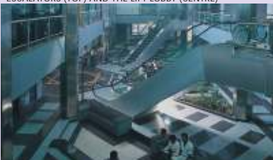
ESCALATORS (TOP) AND THE LIFT LOBBY (CENTRE)