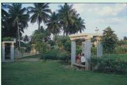
The landscaped garden at Brigade Residency

80% of the complex is pure open space. Other luxurious facilities include: a swimming pool, club house, jogging track, a/c meeting rooms, business centre, gym, 6 large party areas, playgrounds, tree grove, provision for a creche... and more.