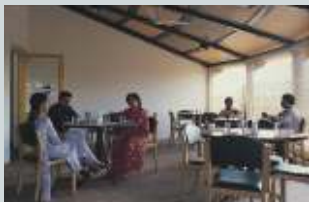
Roof-top party area at Homestead

It's like living in your own luxurious home, instead of staying in a hotel.