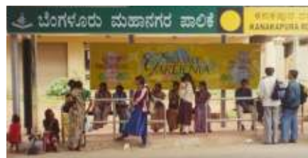
Brigade Gardenia bus shelter at Kanakapura Road

The neon signs on the bus shelters give them a fancy look. It brings alive the surroundings and makes waiting for a bus a little easier. In areas