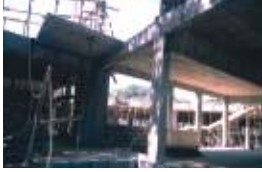
Internal civil work underway