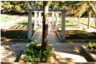
The Millennium Park

The three-acre Millennium Park is ready. The park will be an asset to the residents of Brigade Millennium with landscaped green spaces, an impressive floodlit amphitheatre / stadium, tennis and basketball courts, jogging track, children's play area, theme parks and the Japanese garden.