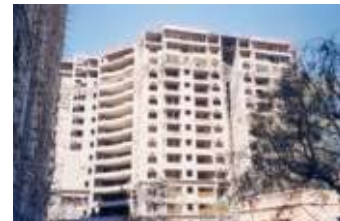
Structured completed - Blockwork of 14th floor underway