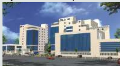
Brigade TechPark, Next to ITPL Up to 400,000 sft (37,200 sqm)

A great software facility at Whitefield !