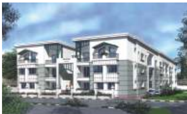
Brigade Tranquil, Yadavagiri, Mysore 2- and 3-bedroom luxury apartments

Our fifth project in Mysore—Brigade Tranquil, with 2- and 3-bedroom apartments—is nearing completion, with just a few apartments still available. We are soon commencing Brigade Parkway, another luxury apartments project, near Cheluvamba Park. In the near future, we will be announcing another project on Gokulam Road.