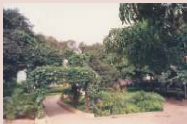
The approach pathway to the Brigade Gardenia project office, as seen from the main gate.

Brigade Gardenia, our 15-acre enclave in J.P. Nagar 8th Phase is rapidly taking shape. The project office and model apartment, with the extensive landscaping around them have a resort-like look. All the apartment blocks are well under construction and the project continues to receive a tremendous response.