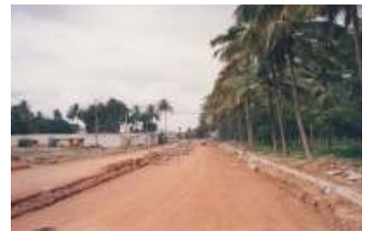
A view of the 24th Main extension

An easier, shorter access to Brigade Millennium