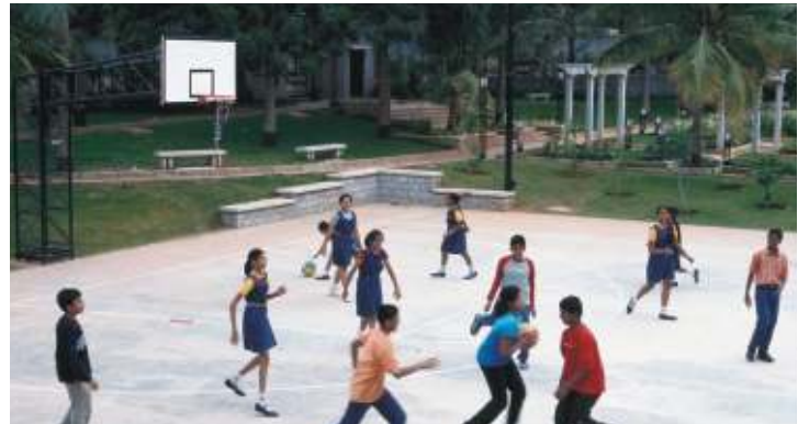
Students at play in the floodlit basketball court in Millennium Park