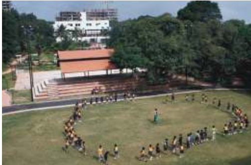
Brigade-PSBB School students exercising at the mini-stadium