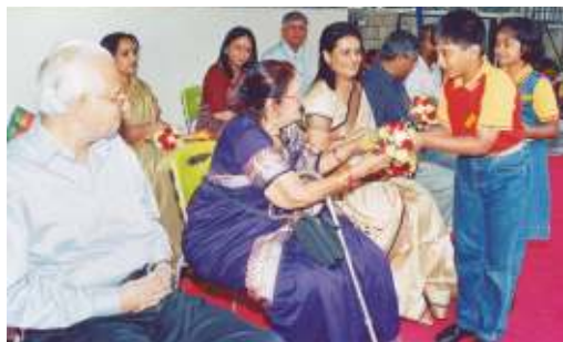
Students greeting the guests at the school day celebrations

The formal inauguration of Brigade-PSBB School was on 13 August, in a function that combined an Independence Day celebration with a first-time get-together of students, teachers, parents and all those instrumental in the setting up and functioning of the