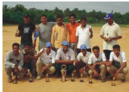
The Brigade team with the runners-up and individual trophies

The tournament, held at Loyola Grounds on Bannerghatta Road, was conducted by Venkataraman Associates, and sponsored by Anchor. The series saw some intense moments of cricket as well as much enthusiasm from members of the eight participating teams—and all their supporters.