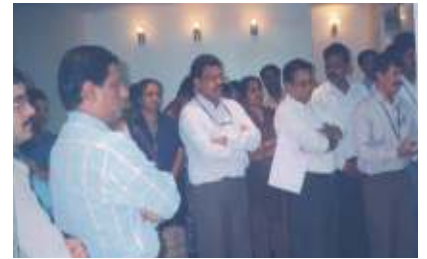
The Brigade team at the inauguration of the marketing team's new office

As the Brigade team is rapidly growing in size with many exciting new projects being planned, the need for additional space that would offer greater focus for the marketing team was being felt for a few months now. The interiors of our new office have been done by Praxis, who have also designed the Brigade-PSBB School.