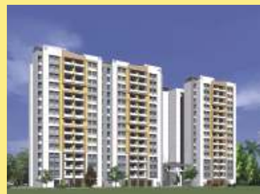
Artist's impression: Golden Magic Block