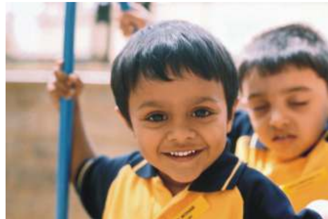
A Brigade-PSBB School student