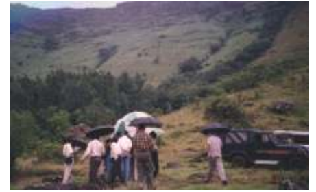
The short-listed architects studying the Brigade Hill Resort site during the visit in a mild refreshing drizzle

The architects have now sent in their designs for evaluation, which will be completed by September.