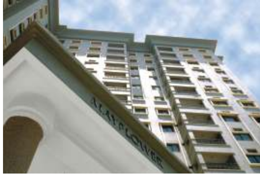
Mayflower, the first of the five blocks in Brigade Millennium, completed and being occupied

The last few weeks have seen Brigade Millennium become a "functioning" enclave. Families have moved in to Mayflower Block, the Brigade-PSBB School is filled with children and people can be seen enjoying Millennium Park from dawn to dusk. What was, till recently, a project-in-the-making has become a dynamic, happy living space. And as construction progresses rapidly, it's becoming easier to visualise how comfortable and exciting life will be at Brigade Millennium.