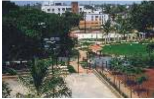
Millennium Park as seen from The Woodrose. The flood-lit tennis court is in the foreground.

The Woodrose currently has 600 members. Now we intend to select 200 more members. A special pre-opening membership fee is being offered, for a limited period of time.