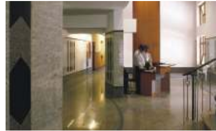
The reception lounge at Mayflower Block

Cassia and Magnolia Blocks are in advanced stages of construction and fully booked. Jacaranda Block is under construction, with work proceeding at a brisk pace. While all 3-bedroom apartments in Jacaranda Block are booked, a few 4-bedroom apartments are still available.