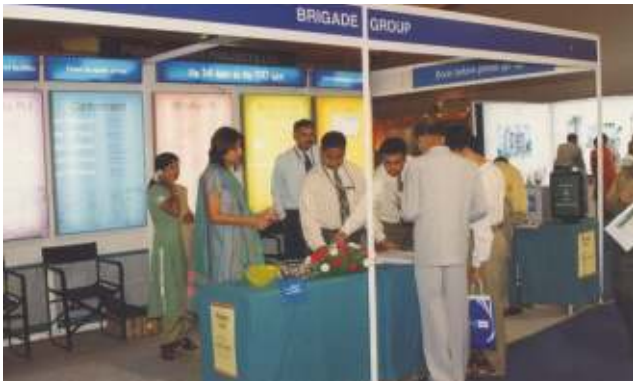
The Brigade stall at Realty, 27 and 28 March

Realty, the half-yearly property and home loans exhibition organised by Karnataka Ownership Apartments Promoters Association (KOAPA) was held at the Grand Ashok hotel on 27 and 28 March. The Brigade stall at the exhibition was much appreciated by visitors to the exhibition.