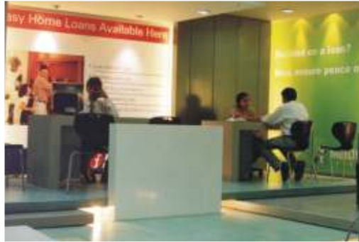
Tandem's one-stop customer service centre at Brigade Plaza

Tandem's Property Management Division takes care of facilities management, which