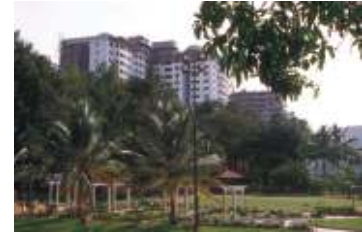
Magnolia Block as seen from Millennium Park

Laburnum, the fifth and final residential block at Brigade Millennium, was launched very recently. The premium quality apartments in Laburnum Block are extra spacious: 4-bed apts (3,200 sft), with large bedrooms, spacious terraces, even servant's quarters. A few 3-bedroom apartments (2,550 sft) are also available.