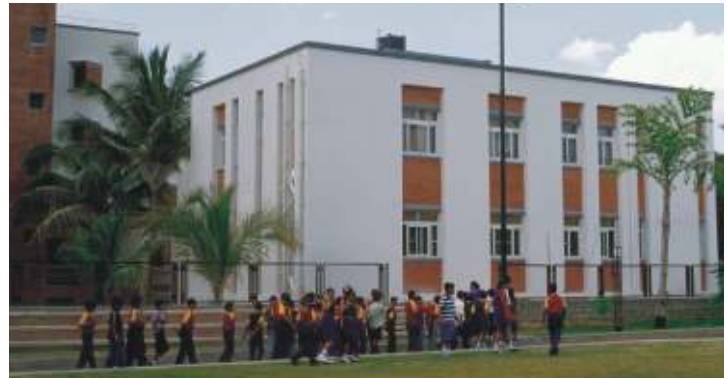
Brigade-PSBB School students return to classes after a sports lesson in the floodlit mini-stadium

established; more are to follow. Below are a few glimpses of school life at Brigade-PSBB School.