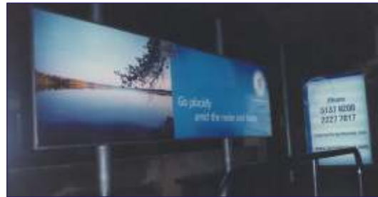
Brigade's bus shelter in Malleswaram

We have in the past tried to do our bit towards enhancing the city's aesthetics. The beautification and landscaping of the approach road to Bangalore Airport's departure terminal was just one such