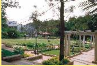
A section of the Millennium Park.