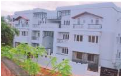
Brigade Tranquil, ready for occupation

Brigade Tranquil, our fifth luxury apartment project in Mysore, has been completed and is ready for occupation.