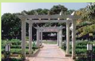
A section of Millennium Park