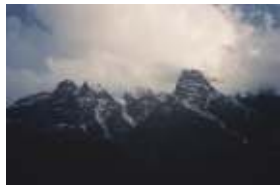
Sundown over Meru

Enjoy your way to the target. Or else the task becomes tougher!: (Harmony among your teammates is vital.) While we carefully