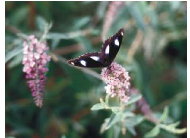
A butterfly—Danaid Eggfly (Hypolimnas misippus)—at home in Millennium Park. More about Brigade Millennium on page 4

Turn to Page 6 for more on Brigade-PSBB School