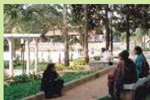
Evening chats and informal get-togethers at Millennium Park