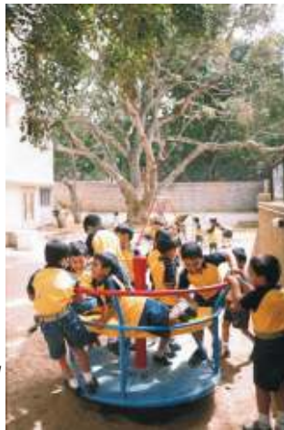
Students exercising in Millennium Park