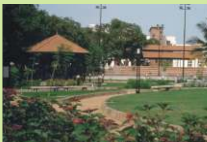
A view of the Bandstand at Millennium Park. The pavilion of the floodlit mini-stadium can be seen in the background