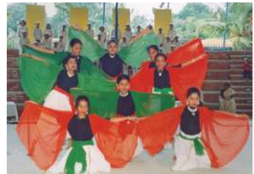
Students put up an impressive independence day performance