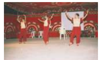
Group dance by some of the Brigade marketing team members

The venue shifted to the covered pavilion for cocktails and dinner. Rain Gods showed restraint, letting a very enjoyable evening end in a leisurely fashion: with conversation, jokes and even a little informal dancing over good food and drink.