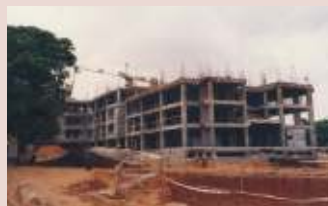
Golden Magic Block