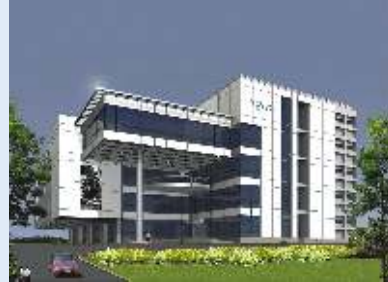
Brigade South Parade M.G. Road (Nearing completion)