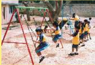
Students in the Brigade-PSBB School play area.

Welcome to Brigade Millennium in J.P. Nagar.