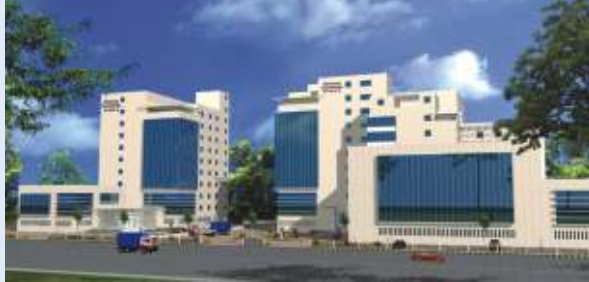
Brigade TechPark Whitefield (next to ITPL) (Under construction)