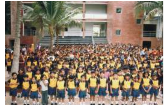
Brigade-PSBB School assembly in progress