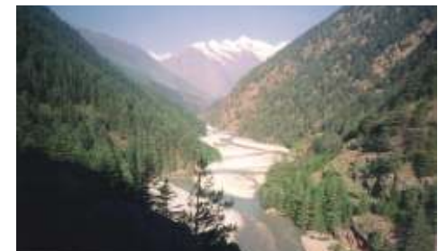
Bhageerathi river flowing in Chidwasa

You feel great when you reach the target and realise it was not that tough after all! When we reached Gaumukh, at about 11:30 a.m., it was a sense of achievement for the whole team. Some shot their 'V' signs into the sky, some wept and some of us stood stunned at the quietly flowing crystal-clear water. She was not the rough riding Bhageerathi but the