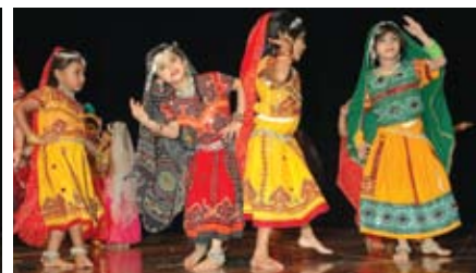
The Brigade School's theme of the year—Delhi—was the focus of our Pre-primary Annual Day. The grand flow of history and evolution of culture were charmingly showcased by our little actors with surprising self-confidence!