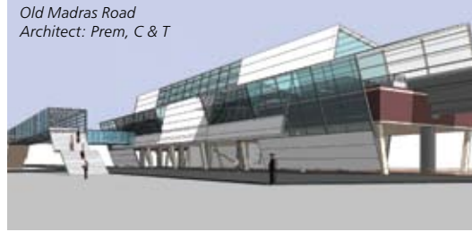
Old Madras Road