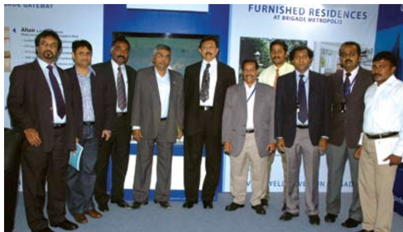
CREDAI Tamilnadu organised the FAIRPRO '09 property exhibition at the Chennai Trade Centre from 13 to 15 February.