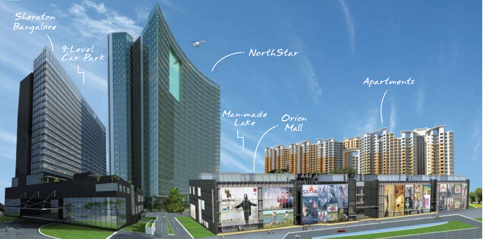
An artist's impression of the Brigade Gateway Enclave, Malleswaram-Rajajinagar, as viewed from Dr Rajkumar Road.