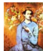
Picasso's Garçon à la Pipe

Pablo Picasso's 1905 painting Garçon à la Pipe became the world's first $100 million artwork when it was sold at auction at Sotheby's in New York in May 2004.