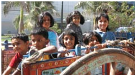
Children on an unforgettable ride during their field trip.

Our UKG also went 'outward bound'—though not so far afield. They experienced the thrills of an exciting night camp at the amphitheatre in the sports field!