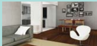
Jackson Furnished Residences Brigade Metropolis Enclave @ Mahadevapura, Whitefield Road

Brigade offers a choice of elegantly furnished residences in convenient locations across the city. Our residences come with a range of facilities and services, ideal for corporates, ex-pats, in-transit senior executives and families visiting Bangalore.