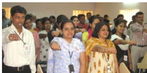
Brigadiers taking the safety pledge

Brigade staff marked the 38th National Safety Week (2-6 March) with training programmes, awareness-raising lectures and demonstrations, distribution of safety badges and taking the safety pledge. Fire-fighting, electrical safety and precautions when working from a height were some of the areas covered. A safety slogan contest was also held.