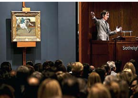
An auction in progress at Sotheby's