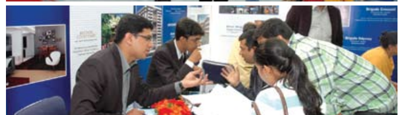
Visitors at the Brigade stall.