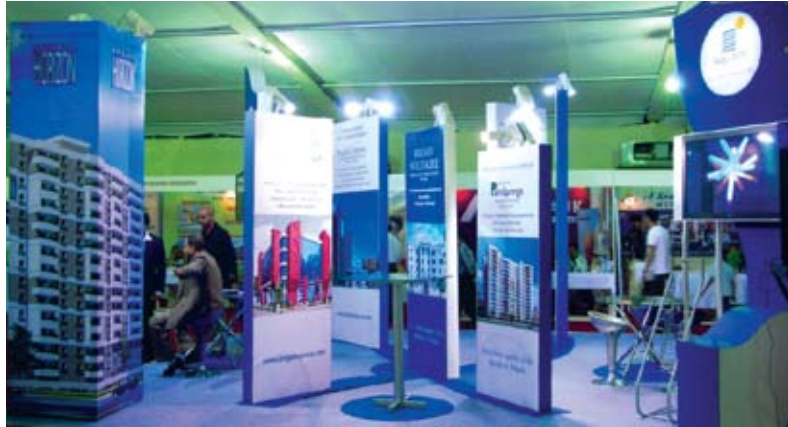
Brigade Group won the 'Best Stall' award at the My Realty exhibition, Mysore, organised by BAI and CREDAI Karnataka, from 23 to 25 May.