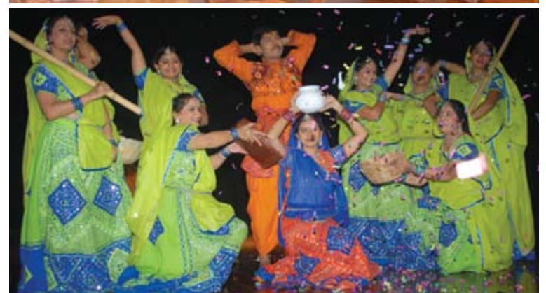
Top to bottom: A performance of the plays from Sudha Murthy's book, Magic Drums—A collection of Short Stories ; The Brigade School teachers performing at the fest.

The entire programme had been lovingly and painstakingly choreographed to the last detail and ran right on schedule. The high levels of performances, professionalism and perfect planning were highly appreciated. The rich and rewarding evening ended with a palate-delighting dinner.