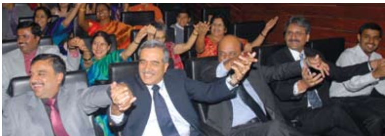
A section of the audience enjoying the evening.