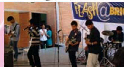
Christ Junior College performing in "Octave".