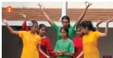
1) Investiture Ceremony – students' council for the academic year 2009–10. 2) Inaugural Intra-Mural Basketball match. 3) Environment Day – Special assembly programme.