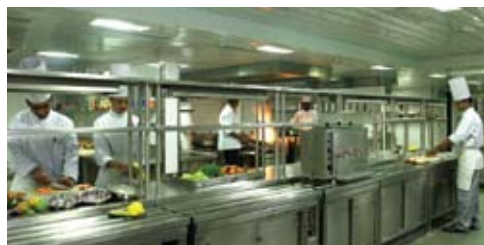
Kitchen at The Woodrose.