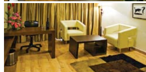
Guest rooms at The Woodrose.