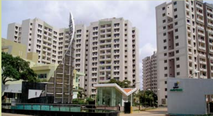
Brigade Gardenia enclave at J.P. Nagar.

“For large comparable complexes in Bangalore, we are the single largest residential association, have our own website, forum, blogs...”