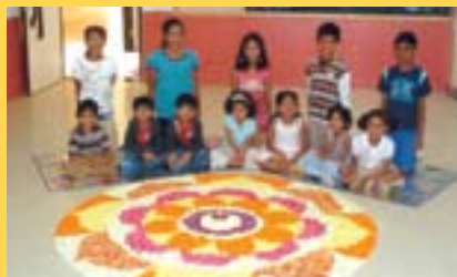
Onam creativity—poo kollum