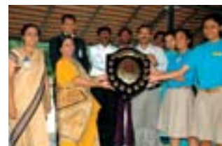
Best House in Sports