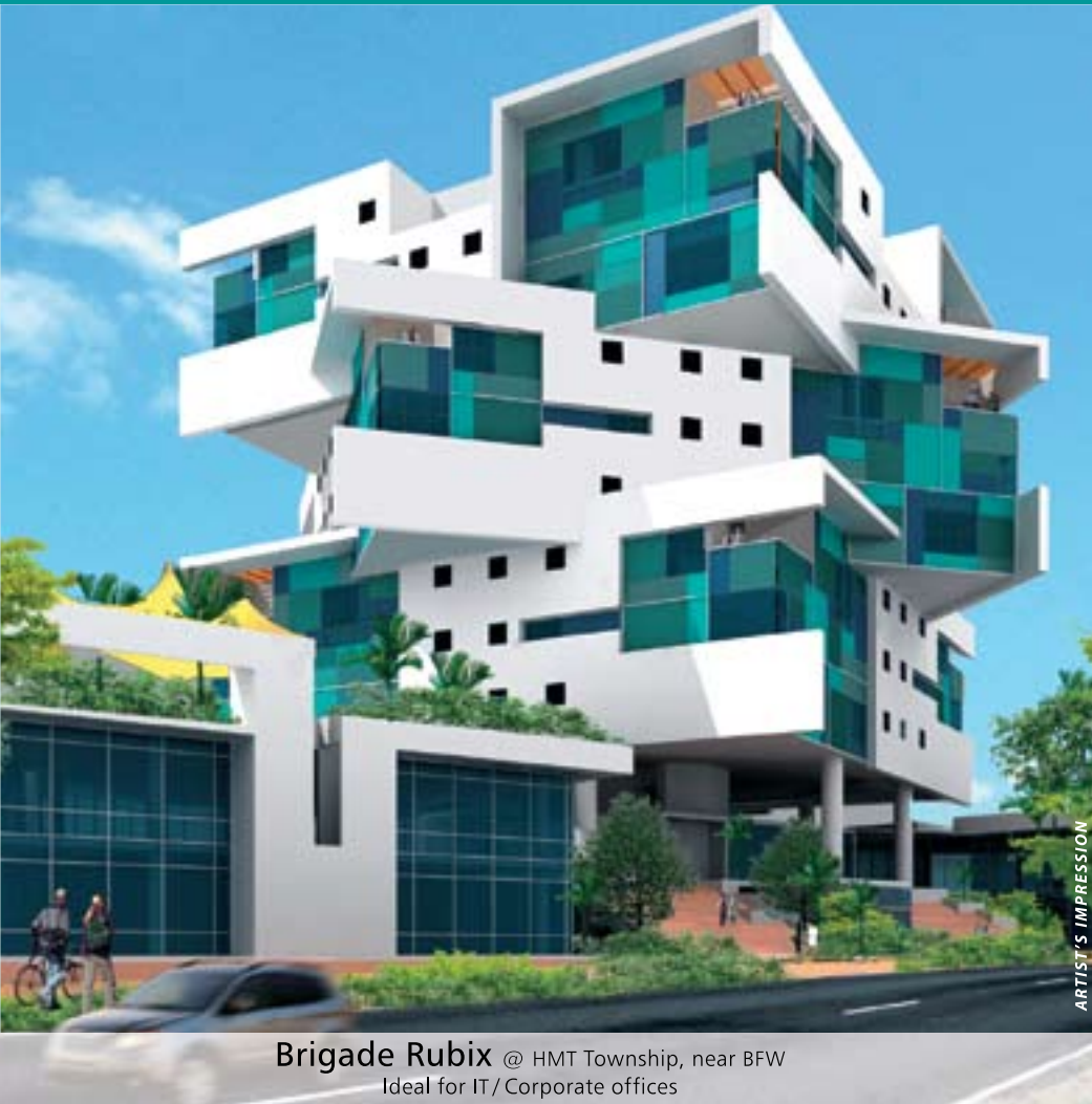
Brigade Rubix @ HMT Township, near BFW Ideal for IT/Corporate offices