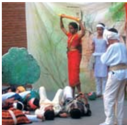
'Onake Obbavva' is the story about a heroic housewife who prevents Hyder Ali's army from entering the fort.