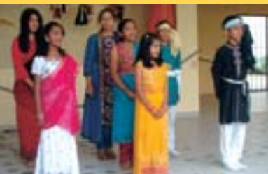
Celebrating Dussera, with songs and a lively Dandiya dance