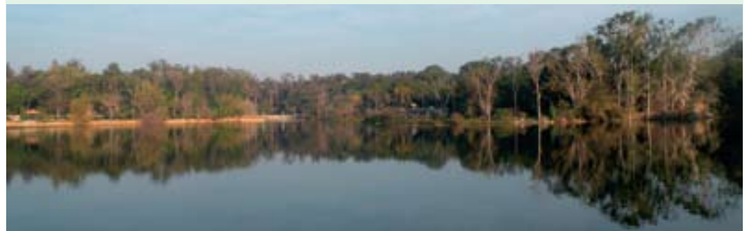
Sankey Lake, Malleswaram, Bangalore [2009]