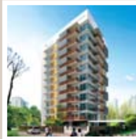
BRIGADE CRESCENT: Nandidurg Road, 4 b/r Premium Residences 4190 sq.ft. to 4290 sq.ft.