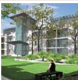
BRIGADE PETUNIA: Jayanagar-Banashankari, 3 & 4 b/r Premium Residences 3150 sq.ft. to 4500 sq.ft.