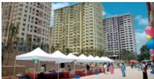
An inauguration ceremony on 30 August marked the successful completion of Phase 1 (comprising residential blocks C, D, E and F) of the Brigade Metropolis enclave on Whitefield Road.