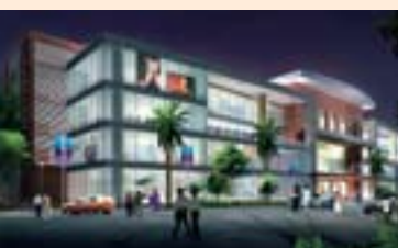
Brigade Vantage , Vinobha Road Large Format Retail

Brigade Sparkle , J.P. Nagar 2- and 3-bedroom apartments