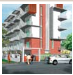
BRIGADE ODYSSEY: Convent Road, 3 b/r Premium Residences 2090 sq.ft. & 2200 sq.ft.

Ph.: +91-80-4046 7600 enquiry@brigadegroup.com www.BrigadeGroup.com