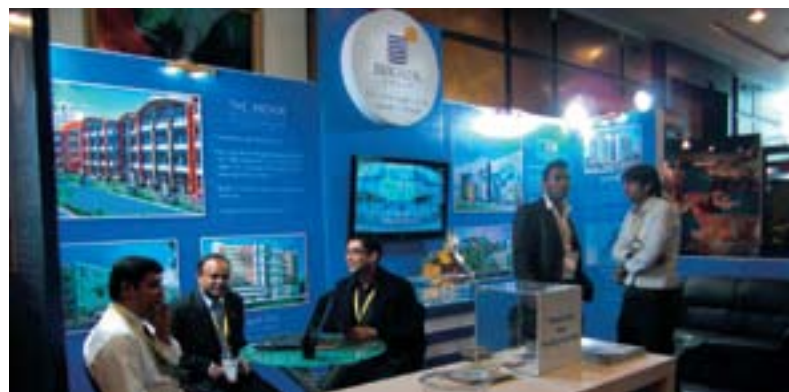
The Brigade stall at Images Retail Forum, Hotel Renaissance, Mumbai (September 16 and 17).