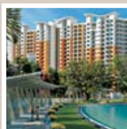
ALTAR WING AT BRIGADE GATEWAY Malleswaram-Rajajinagar 3 & 4 b/r Penthouses 2690 sq.ft. to 3350 sq.ft., Furnished / Semi-furnished Apts. 590 sq.ft. to 2420 sq.ft.