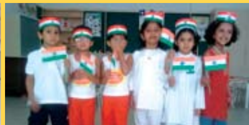
Patriotic spirit on 15 August